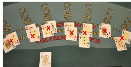
Penalty situations |