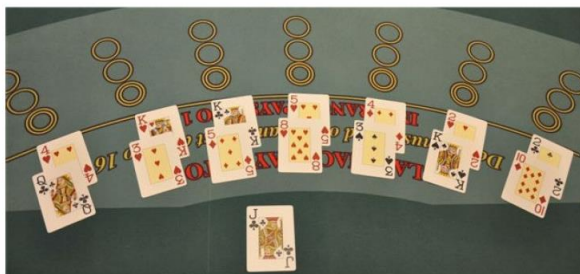
Correct position of the cards